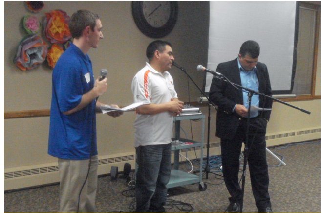
Testimony from Last Year's Banquet

number: 330-682-2892 to make a reservation. We hope you can join us to celebrate what God is doing through Open Arms Ministry in our communities.