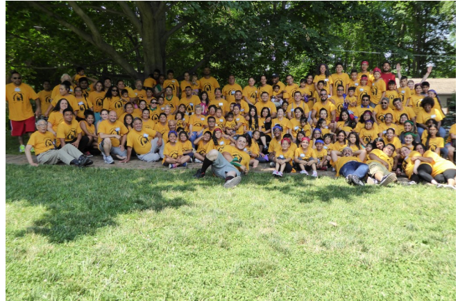
Hispanic Families Encounter

time with their families and to worship the Lord together with bible teaching and songs of praise. As the people leave one hears them saying "Adiós. Nos veremos el año que entra". (Good bye. We will see you next year.)